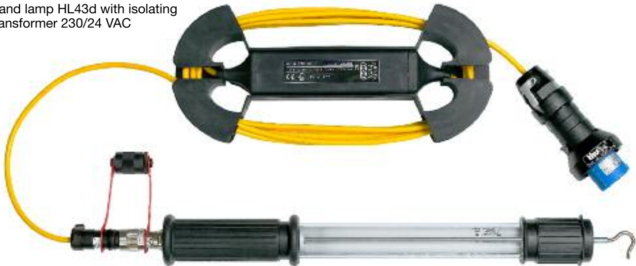
Hand lamp HL43d with isolating transformer 230/24 VAC

Explosionproof fluorescent hand and machine lamps can be permanently installed in Zones 1 and 2 as defined in EN 60 079-10 (gas explosion hazard) or in Zones 21 and 22 as defined in EN 61241-10 (dust explosion hazard). The hand and machine lamp is designed for use in Gas Group IIC potentially explosive atmospheres with protection by flameproof enclosure 'd', and for use in areas where combustible dusts may be present with protection by enclosure 'tD'. The temperature class is generally T5 but with a maximum surface temperature of 95 °C where dusts may be present. With few exceptions, the hand and machine lamps can be used for an extended ambient temperature range from –20 °C to +60 °C (in special cases –20 to +40 °C). They meet the basic safety and health requirements as per Directive 94/9/EC for the design and construction of devices used according to their intended purpose in potentially explosive atmospheres.