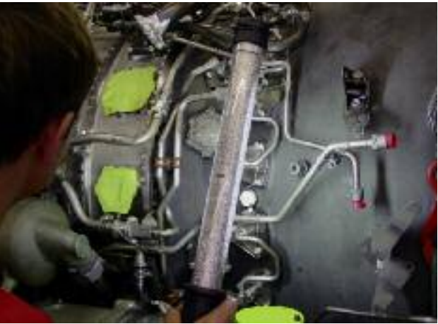
Figure: Aircraft maintenance

In tight spaces and vessels or silos fabricated in conductive materials (e.g. metals), the installation rules require that special care be taken to prevent injury to persons. For these installations, explosionproof fluorescent lamps are available that work with a low voltage, isolating transformers or residual current devices having a rated tripping current of 10 mA. Explosionproof versions of these protective devices can be placed in the immediate vicinity of the lamps or socket outlets.